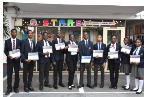
Juilliard students bag Microsoft Office Specialist Award

Juilliard Academy qualifies for the Regional Stage in the AISEN Debate Contest.